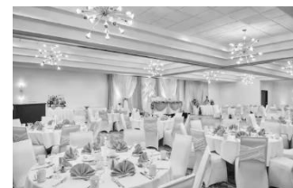
DoubleTree by Hilton Buena Park